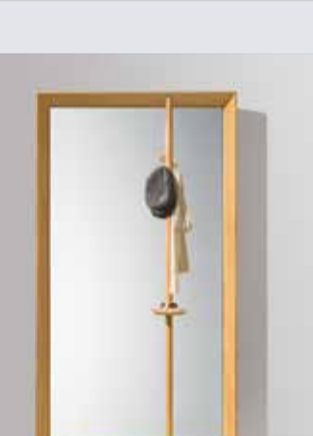
Fig. right: haiku wardrobe panel, 94 x 206.4 x 12.3 cm [w x h x d]

Fig. right: haiku wall panel, 114 x 206.4 x 12.3 cm [w x h x d]